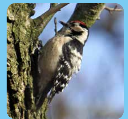
Lesser spotted woodpecker