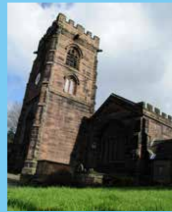
St Mary's Church