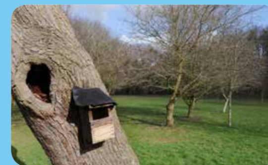
Bottom Pitch Meadow