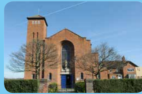
St Bede's Church